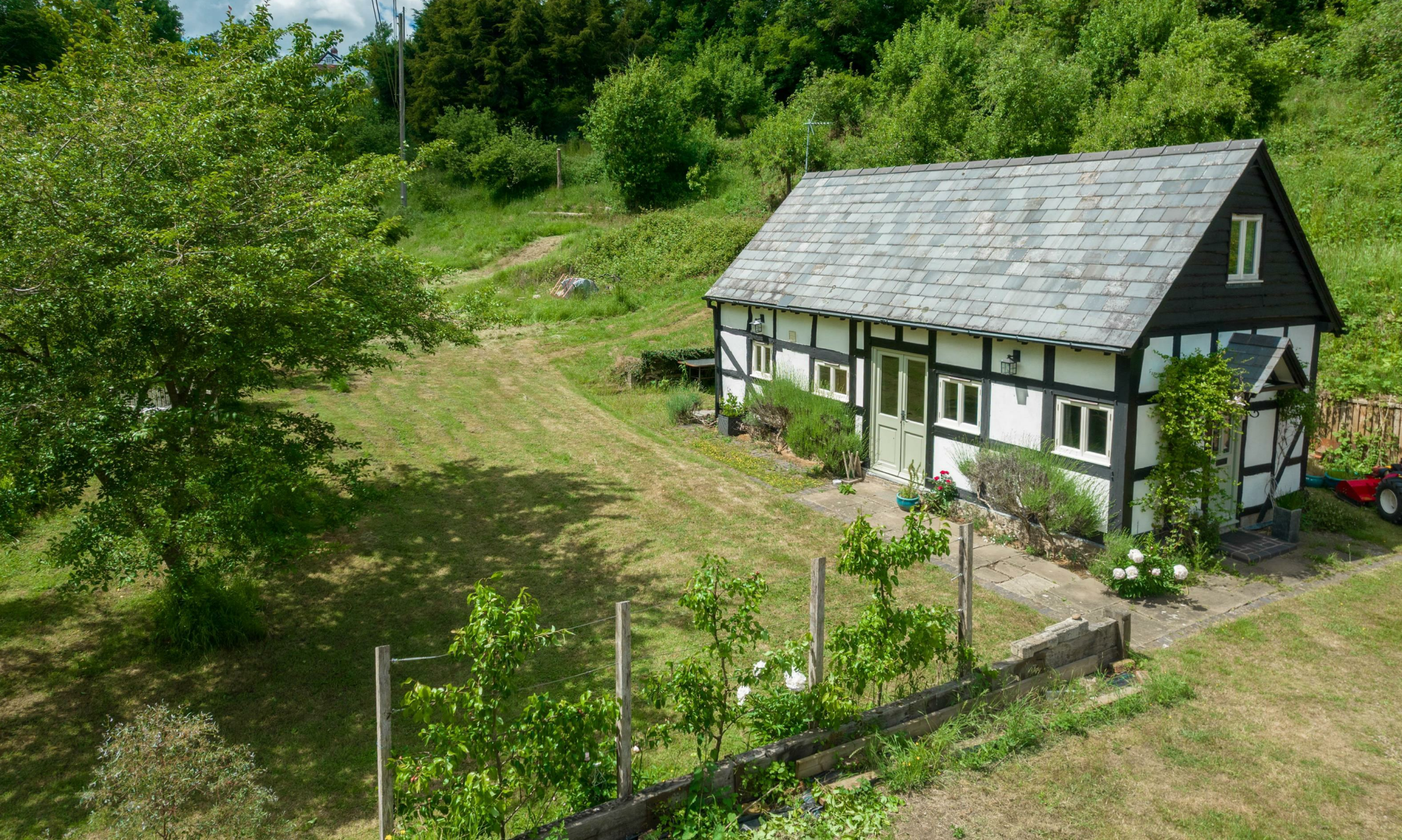
Cider Mill Barn, Hollybush, Ledbury, HR8 1ET